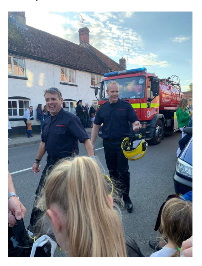
25<sup>th</sup> September – Marlborough College, Combined Cadet Force engagement day